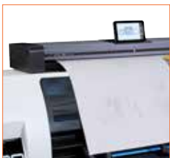
SD One MF is light enough to be placed on any flat surface like a printer.