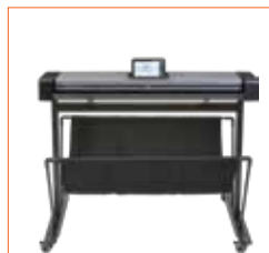
Low stand for side-by-side