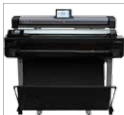
Optional high stand to place over printer.