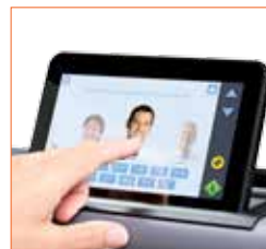
Browse user profiles on the SD One MF and scan direct to preset destinations unique to each user.