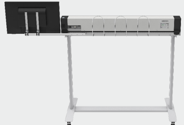
PC built in, no extra hardware in the back