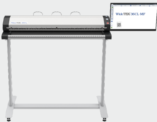
Very compact design